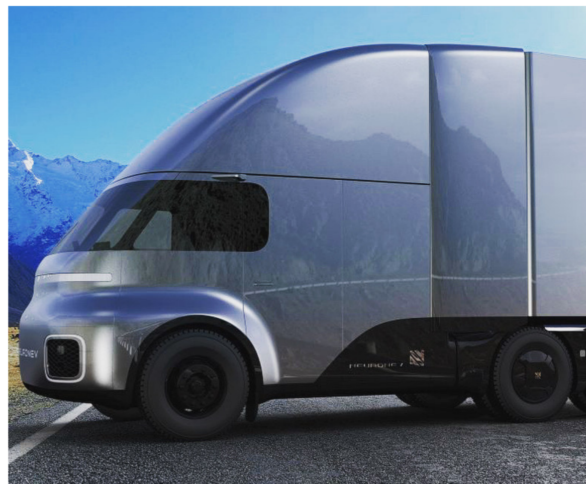
Product Design IDA winner 2019 Neuron EV TORQ