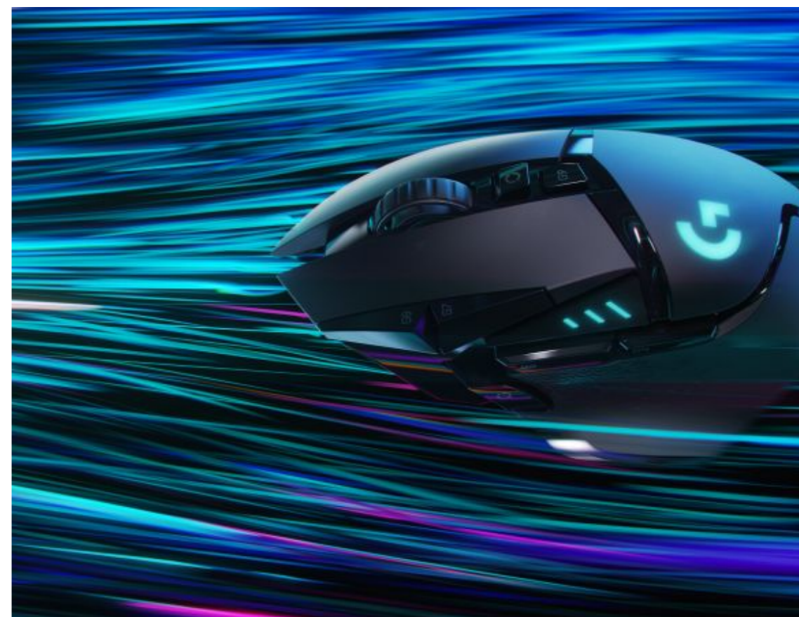
Graphic Design IDA Winner 2019 Logitech Europe SA G502 LIGHTSPEED Wireless Gaming Mouse Video

An esteemed jury panel consists of leading professionals in design, whose talents and contributions to the industry are genuinely aspirational. Collectively they shortlist and reward project entries across the categories of Architecture, Interior Design, Product Design, Fashion Design, and Graphic Design.