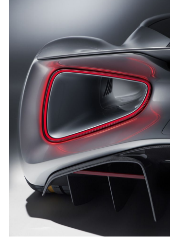
Lotus Evija PRODUCT DESIGN OF THE YEAR

Company Influence Associates