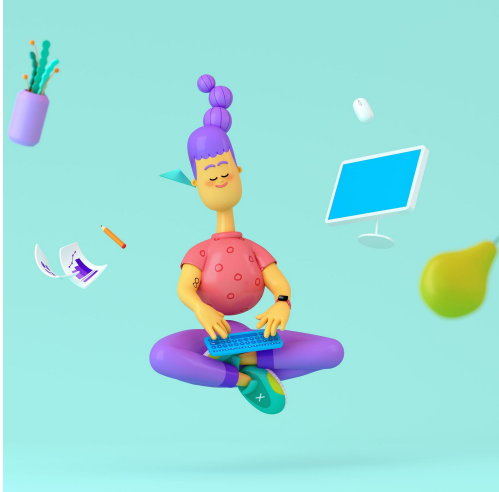
Ergo Characters GRAPHIC DESIGN OF THE YEAR